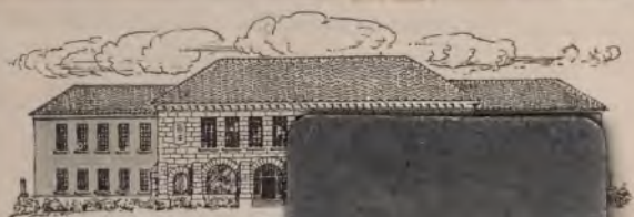
SCHOOL OF LIB.